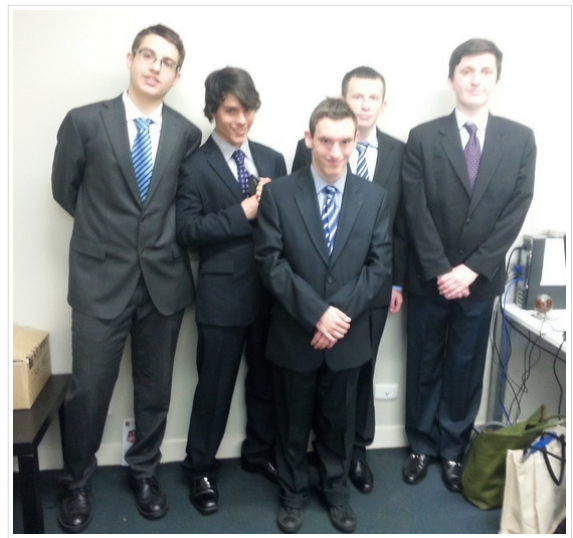
Special Education Faculty