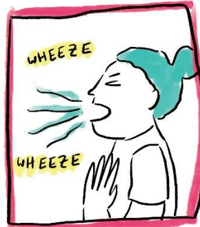
Kinda hard to breathe

Most people who have gotten sick with this coronavirus have had a mild case.