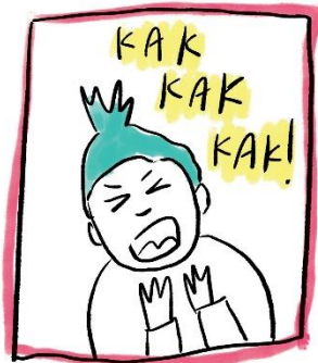
Dry, itchy cough

A lot of the symptoms are similar to the flu (which you might have had before!)