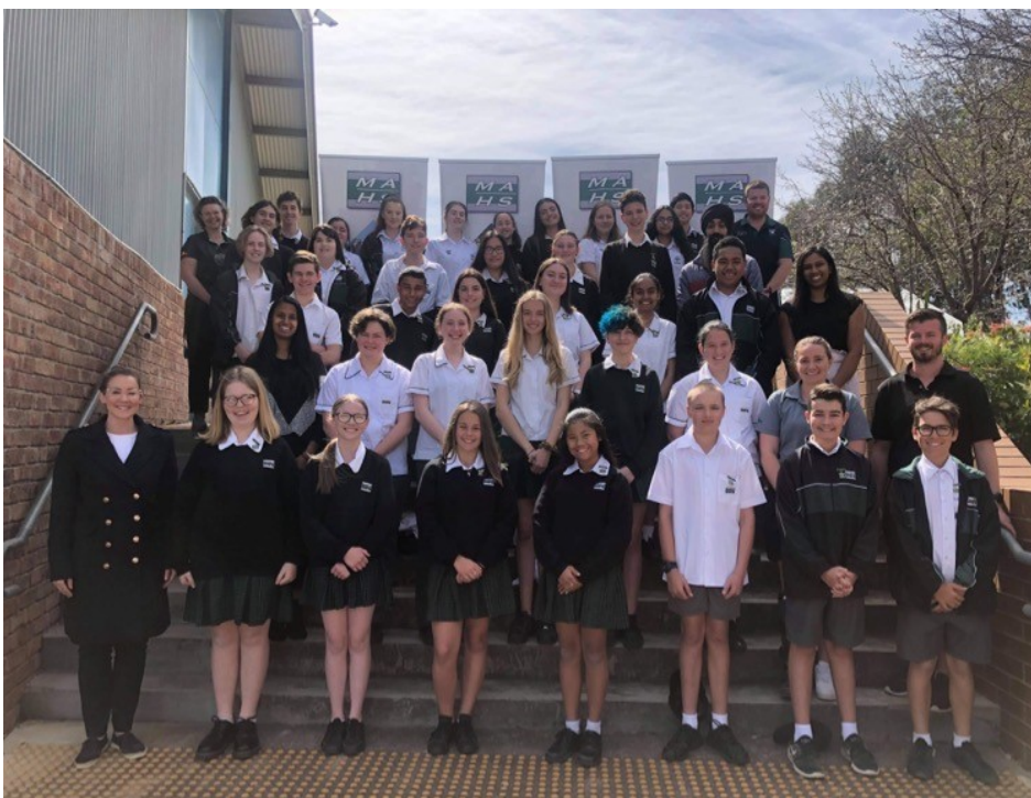
SRC members pictured here with their Year Advisors and Head Teacher Wellbeing.